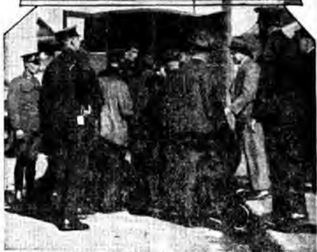
Police bundling arrested men into the patrol waggon after to-day's clash between police and anti-evictionists at a house in Union-street, Newtown.