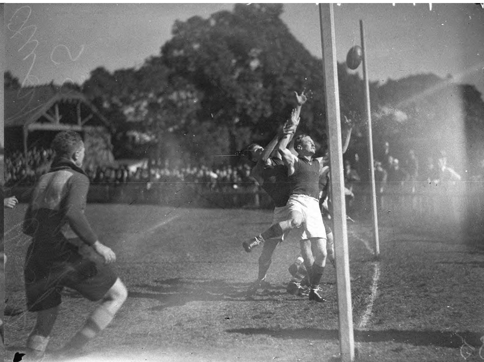
Interstate tramways Australian Rules Football Carnival, 1934