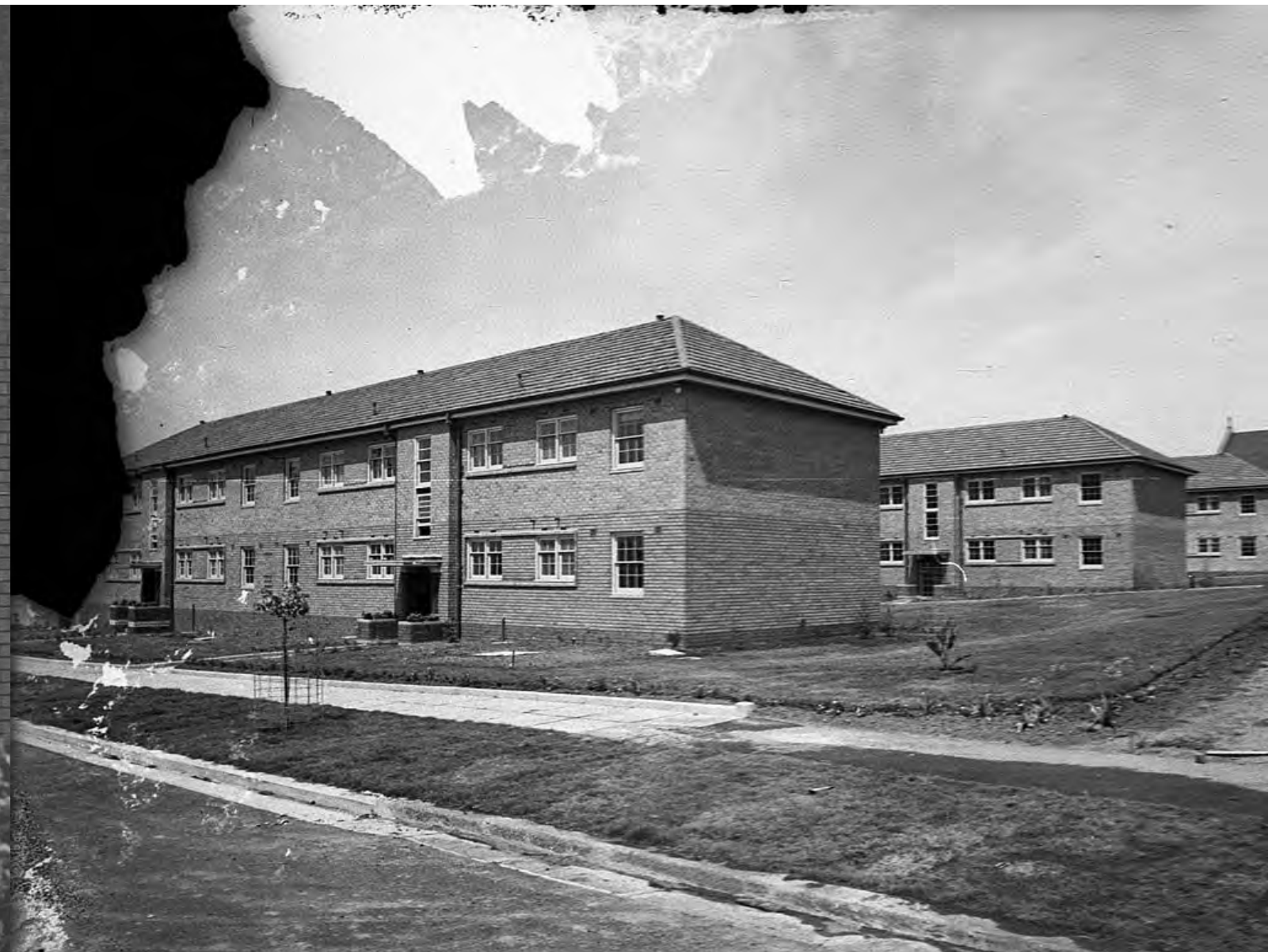
Erskineville Housing Scheme, 1938