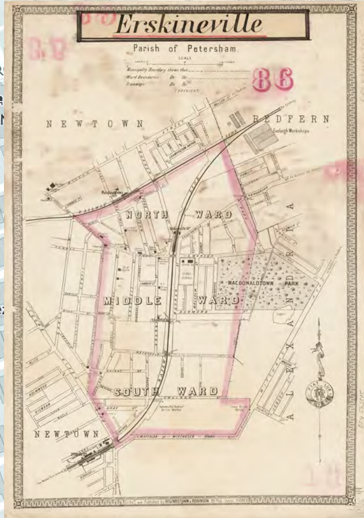
Parish of Petersham, lithographed & published by Higinbotham & Robinson, 1888