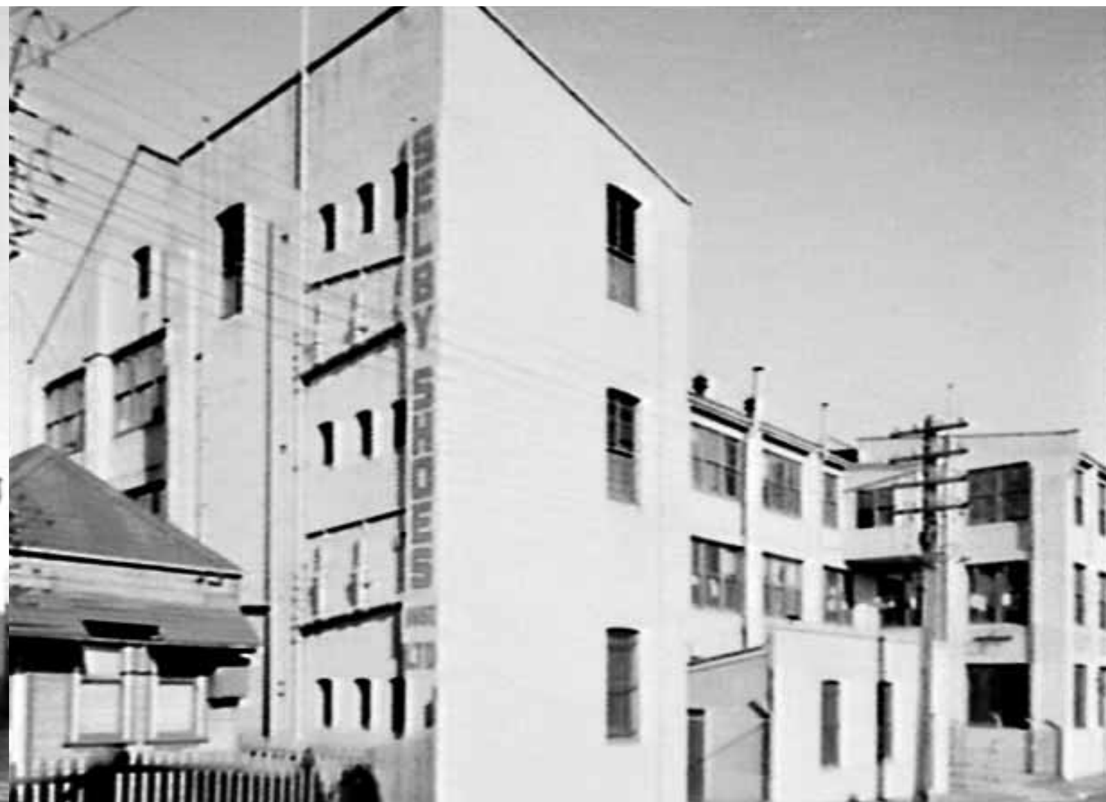
Selby Shoe Factory, 1954, Prospect Street, Erskineville