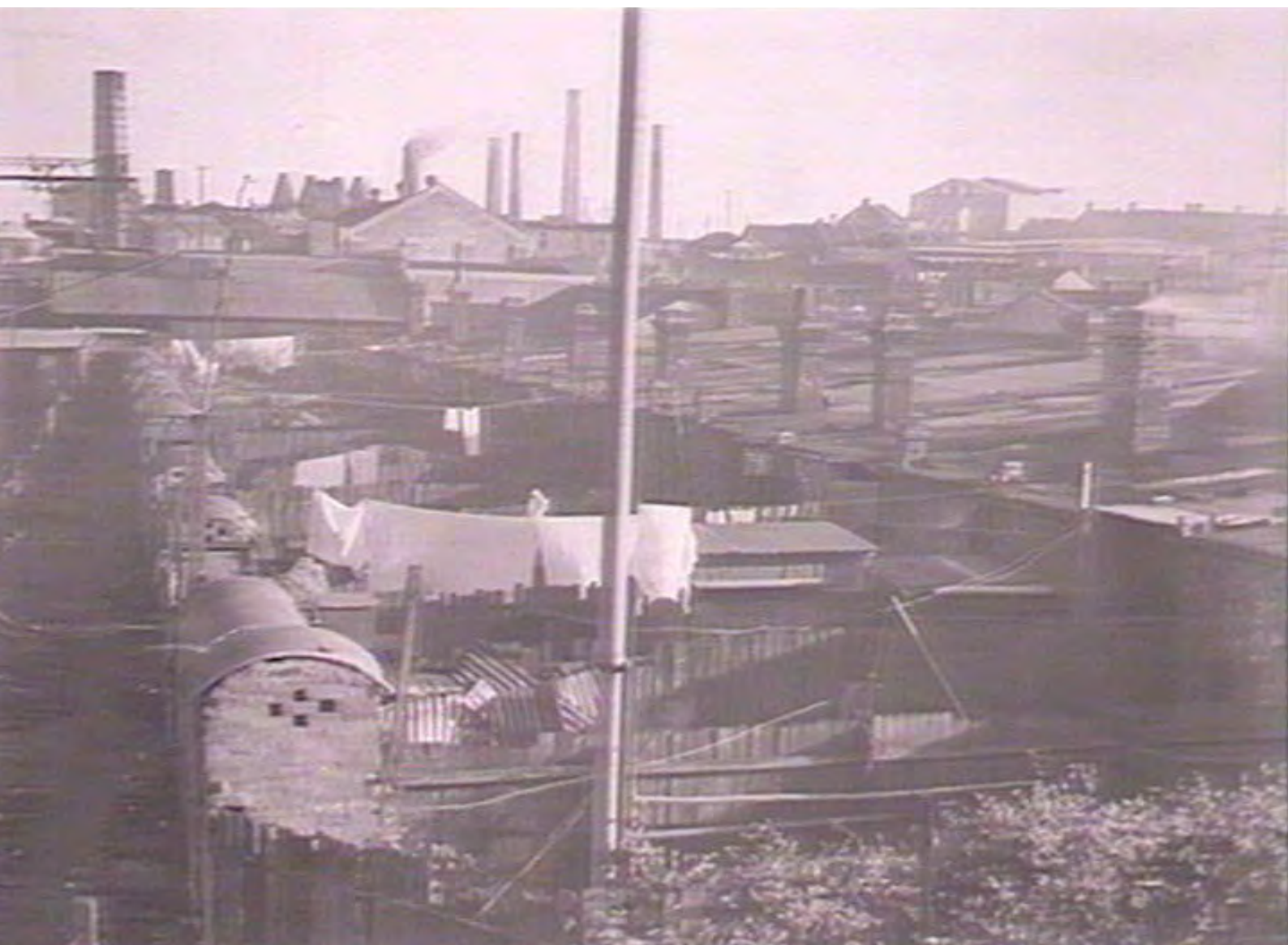
Resumed properties, Erskineville, 1937, courtesy Mitchell Library , State Library of New South Wales