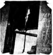
A window in the house on Union-street, Newtown, that suffered during the fight to-day.

In the excitement of the battle, an onlooker, a man aged about 40, whose name is not yet known, had a fatal seizure. The Newtown Ambulance reported that fourteen anti-evictionists and twelve police were injured. All were treated at the Royal Prince Alfred Hospital. Eighteen men were arrested.